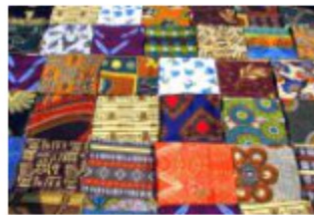
and crafts. art local arts