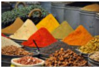
Spice Farm Kijichi