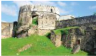
Old Fort Stone Town Tour